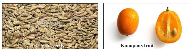
Figure 1. Kumquats fruit and carrot seeds.

The Folin–Ciocalteu assay, adapted from Singleton and Rossi (19), was used for the determination of total phenolics present in the crude ethanol extract of kumquat fruits and ethanol extract of carrot seeds. Total phenolics were calculated with respect to gallic acid standard curve (concentration range: 0\text{--}12 \mu\text{g mL}^{-1} ). Results are expressed