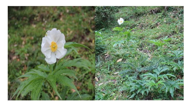
Figure 2. The natural picture of P. emodi , including its habitat, captured by the author from Joshimath (Uttrakhand), India.

Asia, and Pacific North America (20). It is situated in the Northern Himalaya of India, between Kashmir and the Garhwal-Kumaon regions of Uttarakhand (Figure 2) (21), at elevations ranging from 1800 m to 3000 m. P. emodi is most commonly observed on south-facing slopes of deciduous forests that contain various oak species and Quercus floribunda (22). P. lactiflora and P. mairei most likely became sympatric during their retreat, giving rise to the Himalayan species P. emodi and P. sterniana .