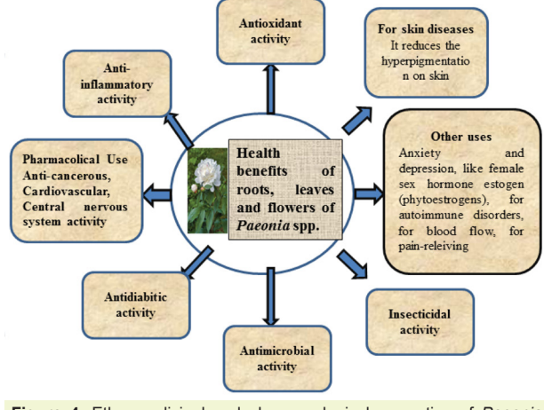
Figure 4. Ethnomedicinal and pharmacological properties of Paeonia spp (2).

palpitations, asthma, and arteriosclerosis. The extract of the roots lowers heartbeat rates, relaxes airways, and reduces blood clotting (33). The dry root of P. lactiflora or P. veitchii ), Radix Paeoniae Alba (dry roots of P. lactiflora ) and Cortex Moutan (dry roots of P. ostii or P. suffruticosa ) are essential Chinese herbal medicine, included in Chinese Pharmacopoeia (34). The plant P. emodi grows in the Western Himalayan region, where locals and scientists use it to prevent epileptic attacks and treat whooping cough and cholera (35). Its tubers treat uterine infections, blood disorders, colic, bilious problems, headaches, dizziness,