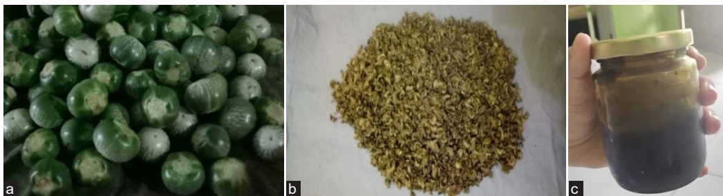
Figure 1. Solanum xanthocarpum fruits: (a) fresh fruit, (b) powder, and (c) ethyl acetate extract.

The antidiabetic activity test determined a significant decrease in blood glucose levels on days 0 (7 hours), 6, 12, and 15 after treatment. The extract with the highest reduction in glucose levels was formulated into nanoliposome preparations. The largest blood glucose decrease on day 15 (72.47%) occurred in rats treated with the ethyl acetate extract, and the lowest was the water extract at 52.75%. The reductions in blood glucose levels are presented in Table 3.